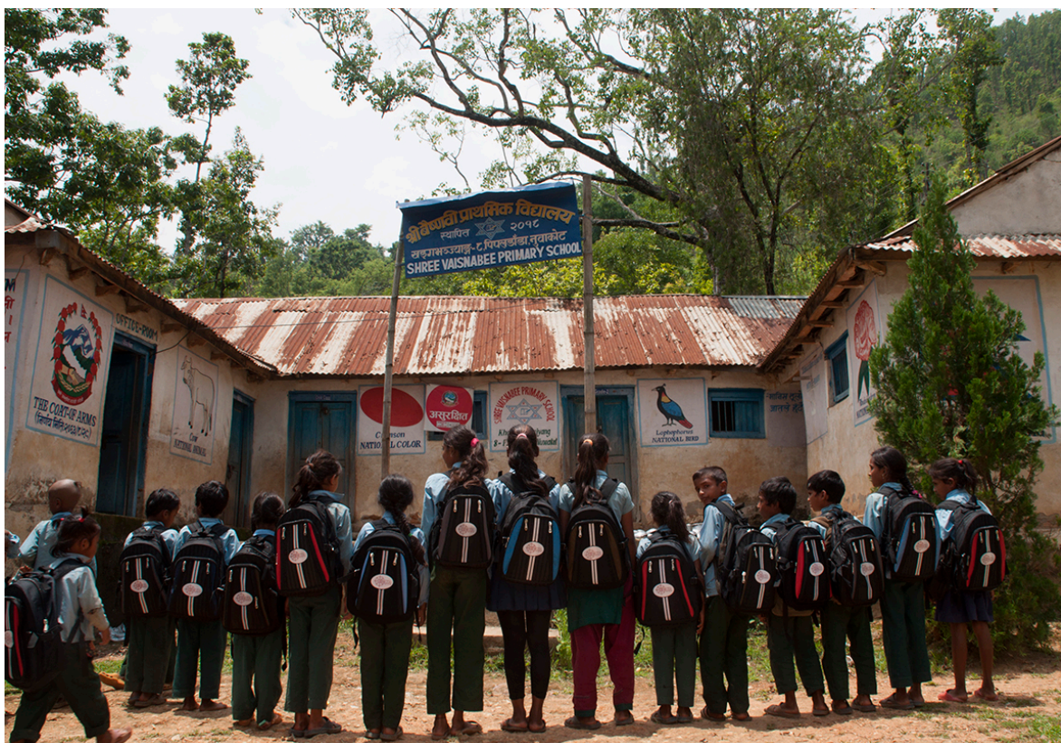
Upaya School bags and stationery, Sri Viashnabi Primary School, Pipal Danda, Nuwakot.