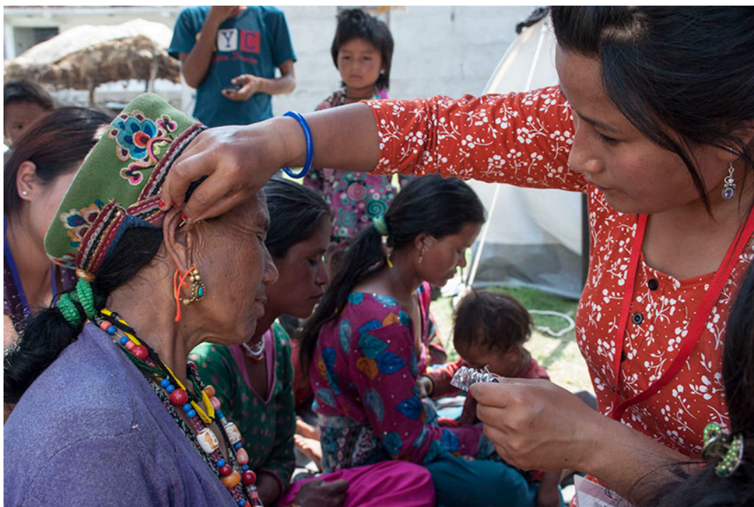
An Acupuncture clinic in Nuwakot for displaced People of Haku Village of Rasuwa.