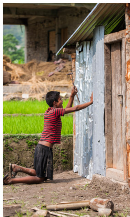
Sira Village, Sindhupalchok. Nepal.