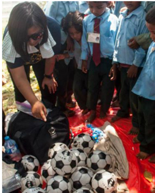
Shri Vaishnavi Primary School, Pipal Danda, Nuwakot.