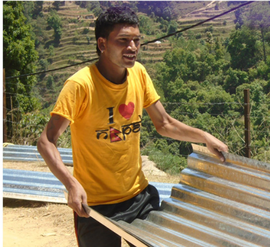
Kukhure chaur, Dhading villagers collecting tin sheets.