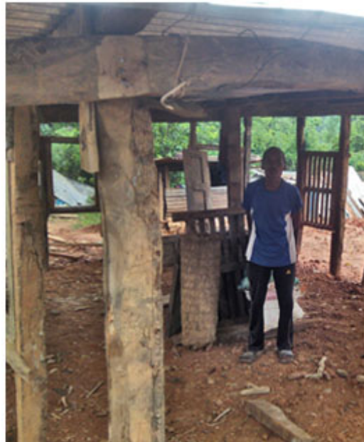
Kukhure Chaur locals build shelter from supplied Tin.