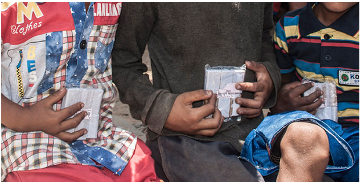
Soaps distribution in Baseri, Dhading.