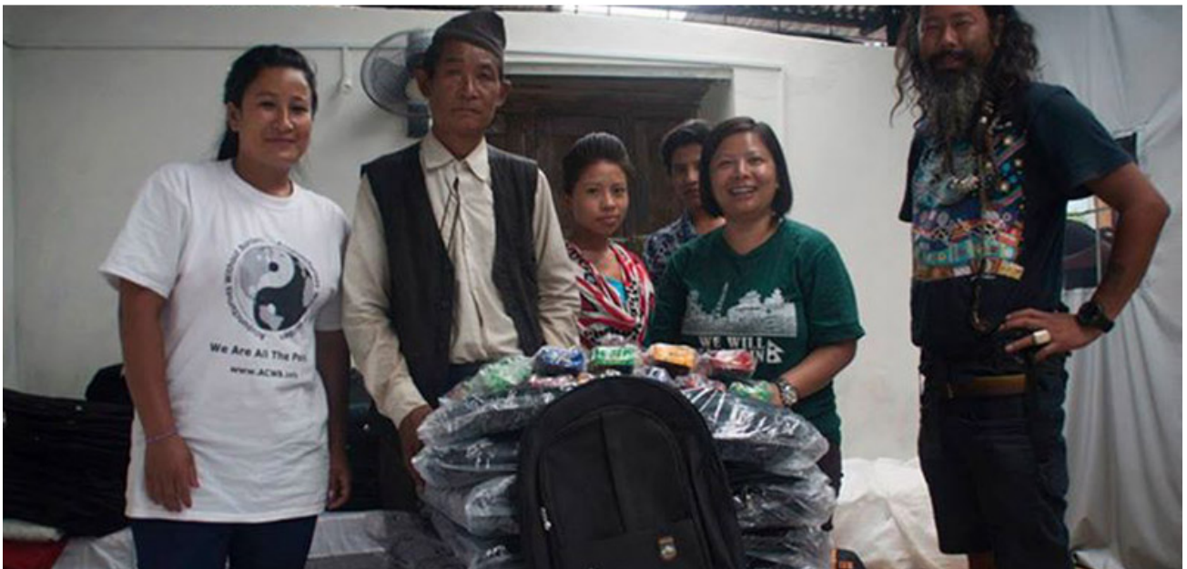
21 School to a Kindergarten run by a Shaman (bottom) in Mandray village (3 hours hike from Tatopani), 100 bags to Government School kids from Kindergarten to Class 5 of Gati Village, Sindhupalchok. (1 hour uphill hike from Tatopani, Nepal-China Border). UPAYA Zen Center organized bags, and we supplemented stationery and toys.