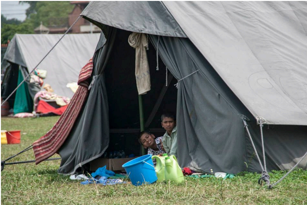
Tents in Kathmandu.