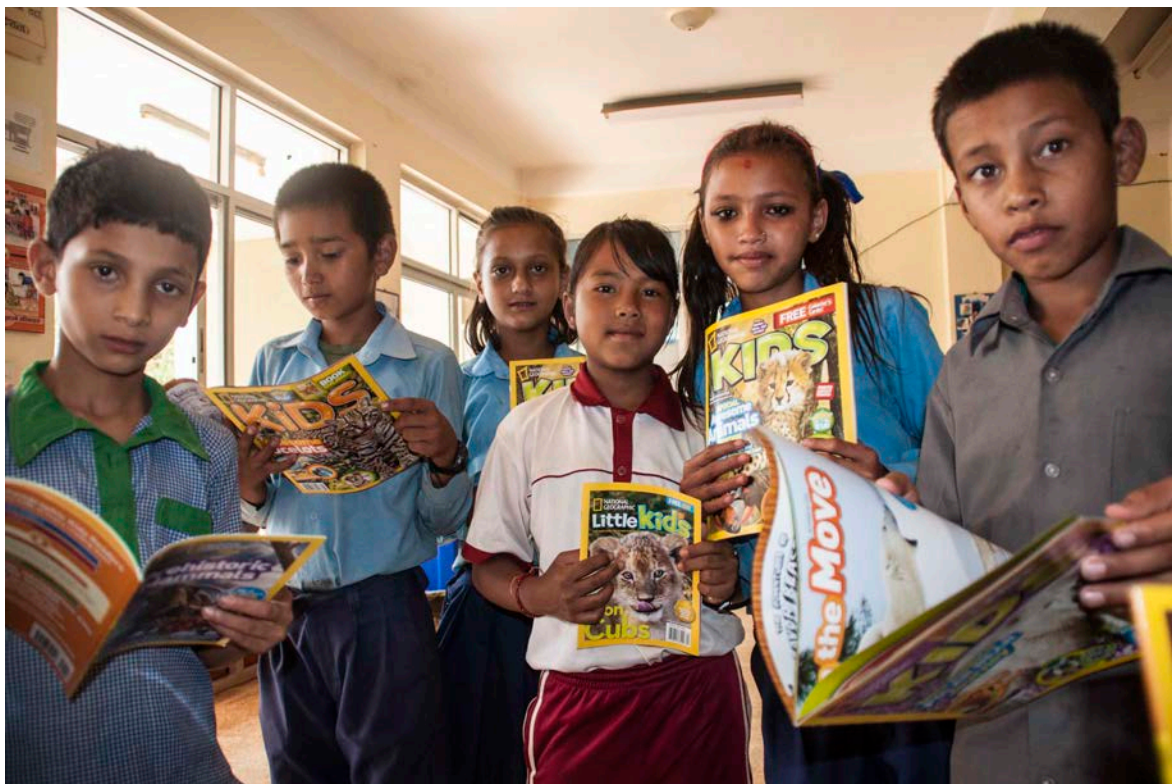
Nat Geo education materials. Kukhure Chaur, Dhading.