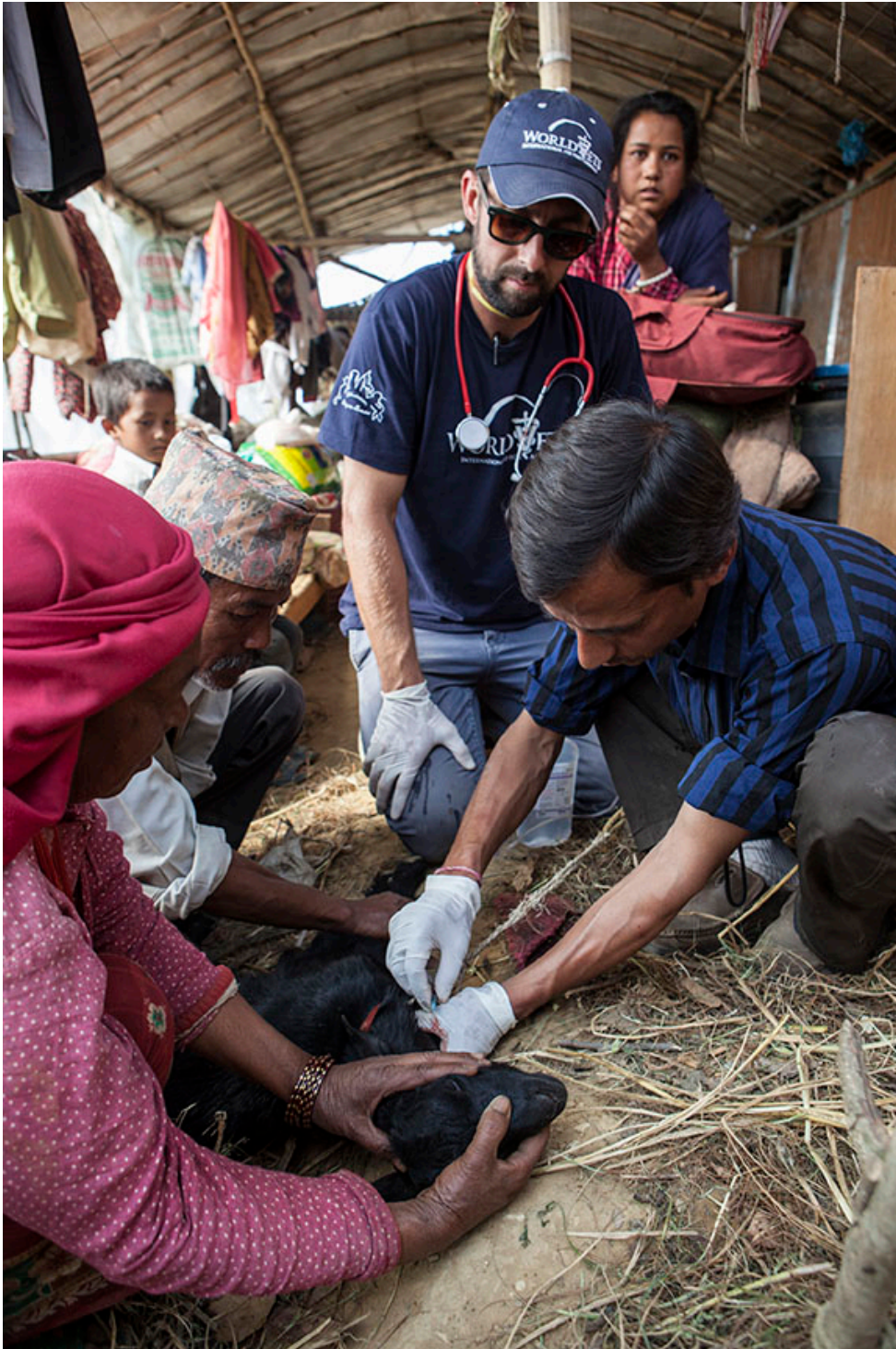
Lele, outskirts of Patan.